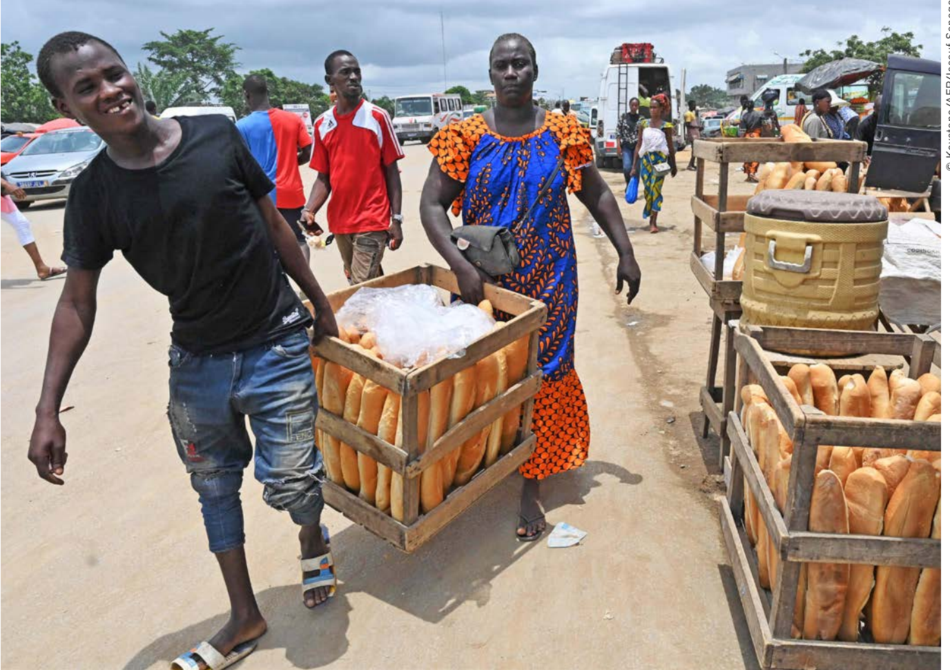
Street vendors in Abidjan, Ivory Coast. Because of rising prices, bakeries are increasingly replacing wheat flour with cassava flour.